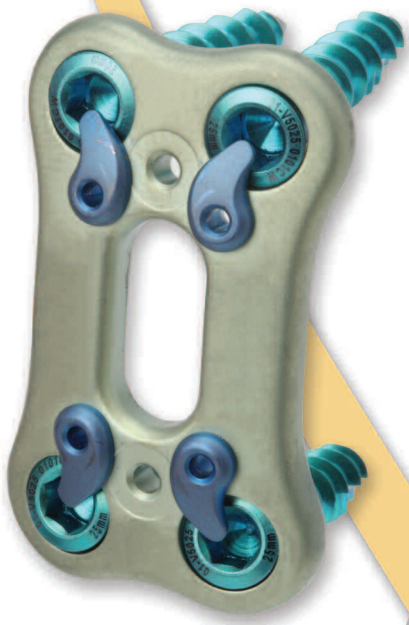
Variable Angled Screws