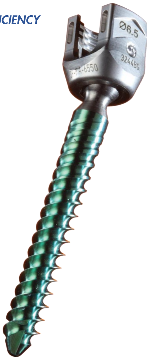
COBALT CHROME TULIP

Reform ® is a comprehensive pedicle screw system that is designed to meet the varying requirements of degenerative, trauma and deformity procedures. Reform features a cobalt chrome tulip, a titanium triple lead proximally tapered thread and titanium and cobalt chrome rods to deliver strength, stability and efficiency to all thoracolumbar constructs. Reduction and uniplanar screw options, along with a full line of hooks, dominoes and offsets, complete the system to simplify the procedure and accommodate individual patient anatomy.